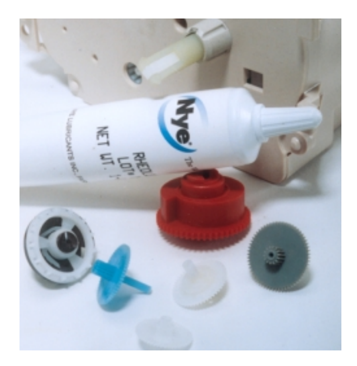
Mallory Controls of Indianapolis, Ind., chose a low-viscosity, synthetic hydrocarbon base oil combined with a lithium-soap thickener and special lubricity and adherence additives to meet the low-temp, low startup torque requirements of plastic gears in its Model 620 appliance timer. The grease was custom-designed by Nye Lubricants, Inc.

Rack and pinion gears constantly change direction and the potential for high shock-loading puts a great deal of stress on not only the gears but the lubricant as well. Additionally, the Visteon system has a spring-loaded, yoke-to-rack mechanism which keeps the rack mated to the pinion. Under mechanical shock-load testing, simulating pot holes and railroad tracks, the rack separated from the pinion, increasing wear and causing an annoying clunking sound — surely a warranty claim in the making. Visteon engineers needed a lubricant to reduce gear wear and the level of noise transmitted through the steering column, and their petroleum grease wasn't doing the job. A newly developed, high-viscosity, synthetic base oil with a lubricious thickening agent and extreme pressure (EP) and antiwear additives was applied to the gear teeth as well as the spring-loaded, yoke-and-rack interface. It passed all gear and yoke wear tests — while imparting a smooth, quiet, quality feel to the entire steering system. Further, when Visteon switched from petroleum to synthetic grease, manufacturing costs decreased because less lubricant was needed per part.