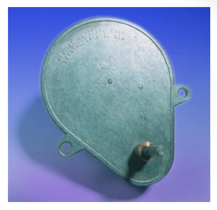
A Class N gear motor by Autotrol Corporation uses a perfluoropolyether grease by Nye Lubricants, Inc., to meet its customers' 6,000 wear-cycle and 232°C temperature requirements.

Class N motors automatically lock oven doors during selfcleaning cycles when the temperature hits 232°C and unlock the doors during cool-down. Autotrol had selected a high-temperature, engineered plastic for the gearing. However, the