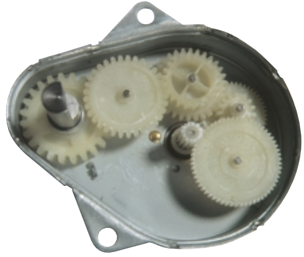
Figure 5 A sub-fractional horsepower electric gear motor by Autotrol Corporation powers the TEG<sup>®</sup> Coagulation Analyzer. Gearing is lubricated with a light, thixotropic, synthetic hydrocarbon grease by Nye Lubricants.

ally stays where it's put, so engineers can eliminate the cost of oil seals and seal design, which are essential to prevent leakage in an oil-lubricated component. Greases also prevent wear better than oils. Further, specially formulated greases can do more than provide lubrication. They can act as a seal against contaminants and moisture, quiet noisy plastic parts, control free motion such as coasting and backlash, promote electrical conductivity, and even impart a "quality feel" cost-effectively. Greases are also more forgiving, allowing engineers to be somewhat less exacting about perfectly mated parts.