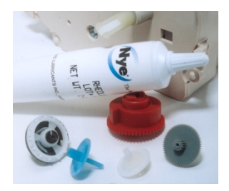
Figure 2 Plastic gears in Mallory Controls' Model 620, a timer for commercial laundry, laboratory cleaning equipment, dairy equipment, and domestic clothes washers and dishwashers, use a NLGI Grade 2 synthetic hydrocarbon grease with special lubricity and adherence additives. Mallory reported that the grease reduced gear tooth wear, dampened acoustic noise, and substantially increased timing cycles.

The molecular structure of many synthetic oils also gives them a higher film strength than petroleum. It is the film of oil that keeps two moving parts from rubbing against one another. Higher film strength enables synthetic oils to withstand heavier loads and faster speeds, which make them better able to prevent wear.