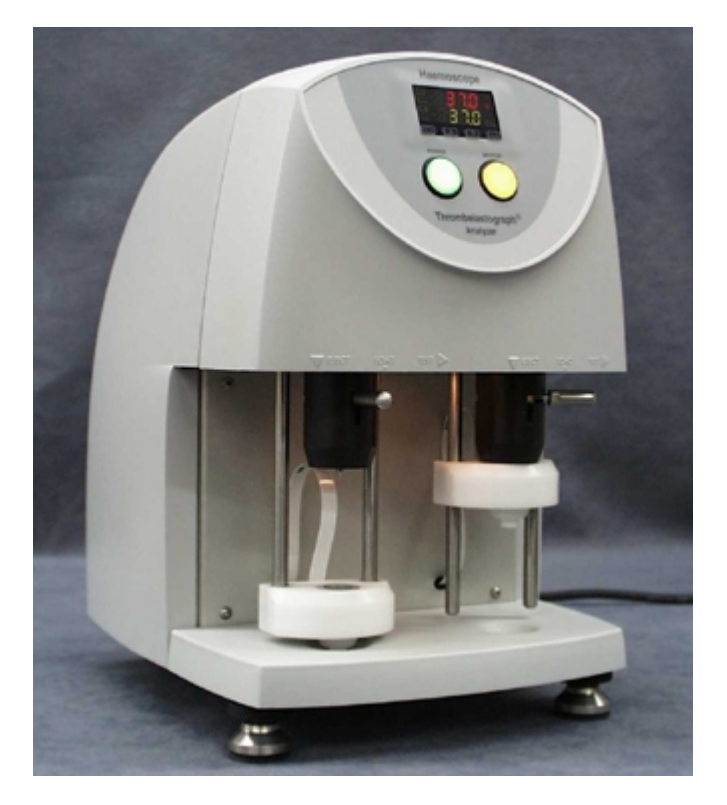
Figure 4 Thrombelastograph<sup>®</sup> (TEG<sup>®</sup>) Coagulation Analyzer, manufactured by Haemoscope Corporation of Skokie, III., tracks the shear elasticity of a clot and its ability to arrest bleeding — in real-time, during a medical procedure. It relies of two greases by Nye Lubricants, one in the gear motor (see below) and one where mating parts slide on the frame.

with specific physical and chemical characteristics. Some thickeners work only with some base oils chemistries while others, such as silica and PTFE can be considered universal. The additives used in a lubricant provide even greater design flexibility. Additives are mixed in small concentrations with the oil and thickener — usually less than 5 percent by weight — to enhance critical performance properties of a grease, such as low temperature torque, metal corrosion protection, or fluid oxidation resistance ( See Figure 2 ).