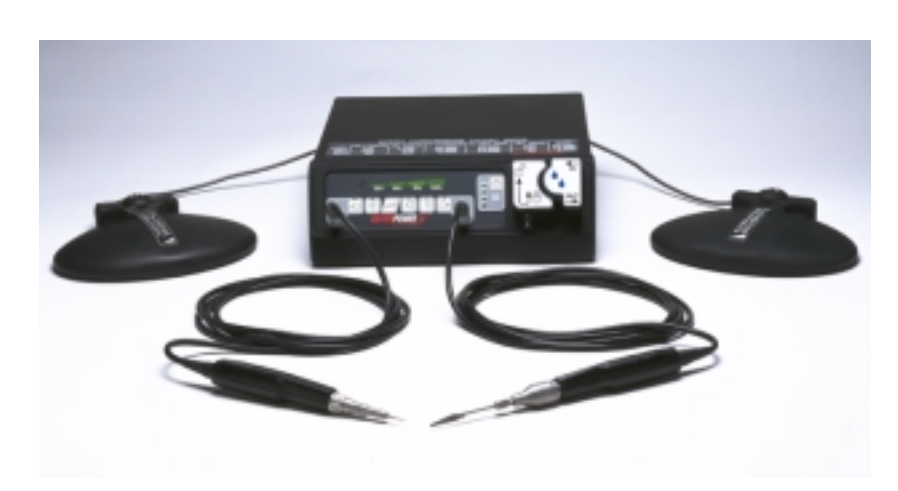
Figure 3 A modular surgical handpiece system by OsteoMed Corporation is used for the dissection and drilling of small bones. A filtered, fortified synthetic hydrocarbon oil by Nye Lubricants is recommended prior to autoclaving to flush and lubricate bearings in the system's 11 saw and drill attachments. High-speed dental handpieces also use synthetic hydrocarbon oils in the turbine bearings. Typically, the bearings are re-lubricated with oil and placed in an autoclave after each use.

Polyglycols , like esters, have an affinity for specific metals, such as brass or phosphate bronze. They offer good lubricity and film strength. A "clean-burning" lubricant, they are commonly used in arcing switches where they leave little or no residue, which would act as an insulator. Because they offer good load-carrying ability, polyglycols are also particularly effective in large worm and planetary gears to reduce friction and improve efficiency. They are the only synthetic oils which include water-soluble versions. Like esters, however, they present compatibility polycarbonates, ABS resins, natural rubber, Buna S, and butyl.