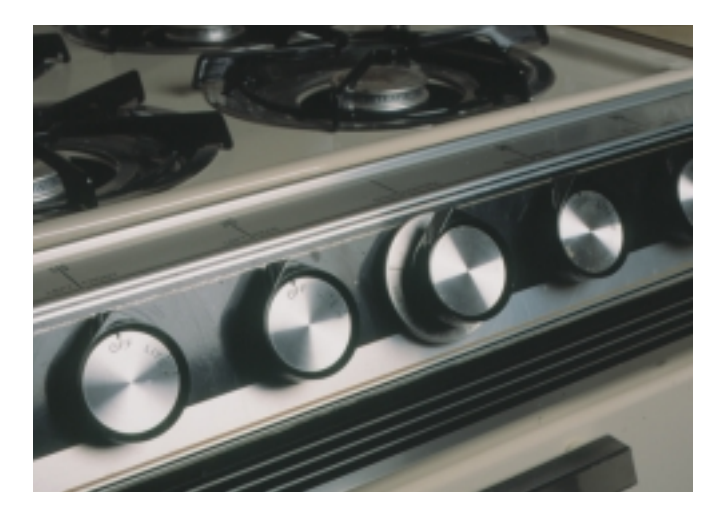
Figure 6 A smooth "velvet feel" for appliance control knobs is one of the benefits of applying a synthetic hydrocarbon "damping greases" to the stem. Damping greases are used to cost-effectively control motion and noise in mechanical and electromechanical devices. A different application: bearings that are actuated during the spin cycle of washing machines purr more quietly because of damping grease.

greases must retain their damping qualities throughout the temperature range of the application. Synthetic hydrocarbon greases are often suitable for -40^{\circ} C to +120^{\circ} C. For temperatures lower than -40^{\circ} C, silicone-based damping greases are available, some of which can damp at room temperature and still be operable at -60^{\circ} C. Because of potential contamination problems, silicone-based greases are not recommended for many optical and electrical applications.