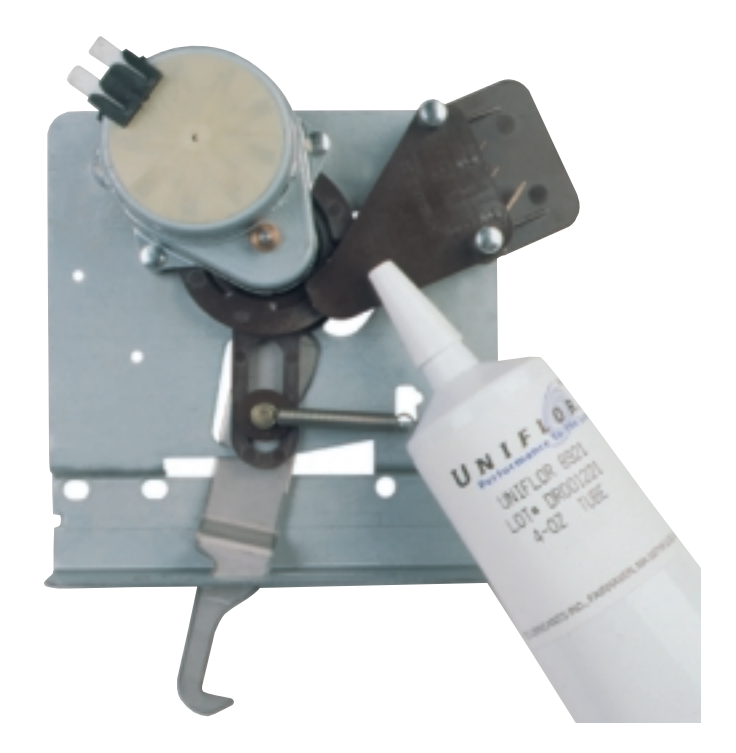
Figure 1 Kingston's new low-profile, motorized range lock relies on thermo-plastic parts lubricated with a PFPE/PTFE grease to survive oven cleaning-cycle temperatures in excess of 232°C. Its Class N motor also uses a PFPE/PTFE grease.

Petroleum does have its limits, however. As early as the 1920s chemists had begun to search for a synthetic alternative to petroleum to improve the performance of automotive crankcases in cold weather. Petroleum becomes virtually intractable at freezing temperatures — and so did the crankshafts it lubricated. World War II made the research more critical. The need for a low-temperature lubricant in high-altitude